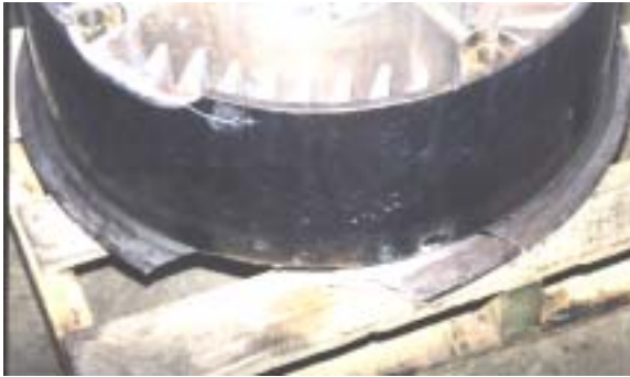
Broken block--repaired and coated with 420 stainless and finished