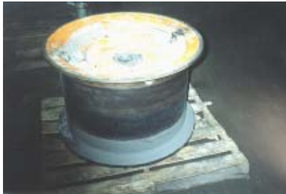
40" diameter block, coated with 420 stainless and finished