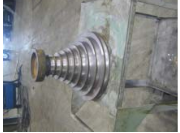
10-step capstan rebuilt to size with 420SS, carbide coated and finished