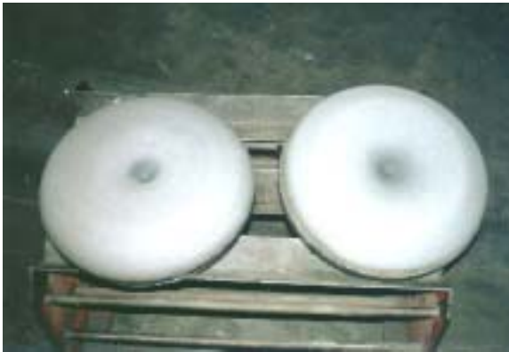
Morgan top hats completely rebuilt