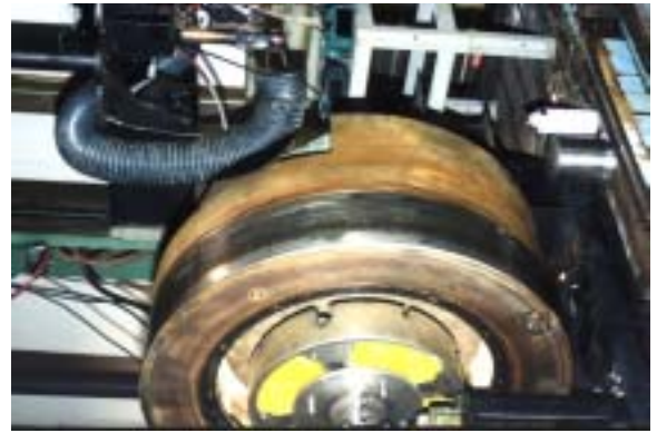
40" diameter shaver block laser clad with NiCrBr 60Rc