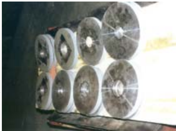
10" diameter V sheaves fused coating 60 Rc