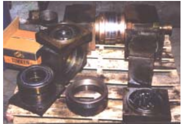
Flattening mill assembly rebuilt bearing and seal areas