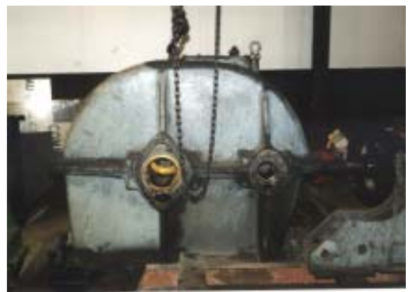
Gear box rebuilt bearing bores and shaft seal areas