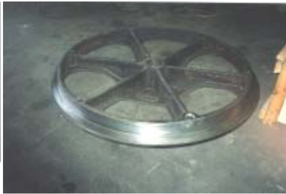
68" diameter wire coiler wheel built up with 420SS and finished