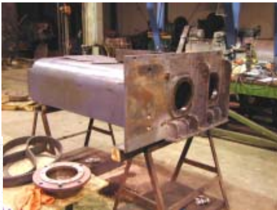
Large machine housing rebuilt bearing bores