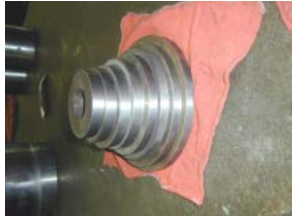
Wire capstans carbide coated and finished