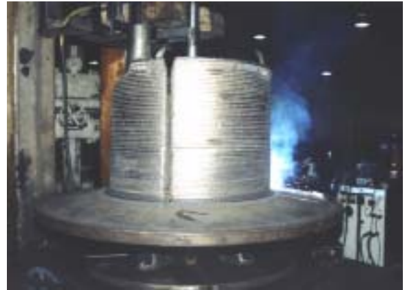
48" diameter block weld overlay and finish ground