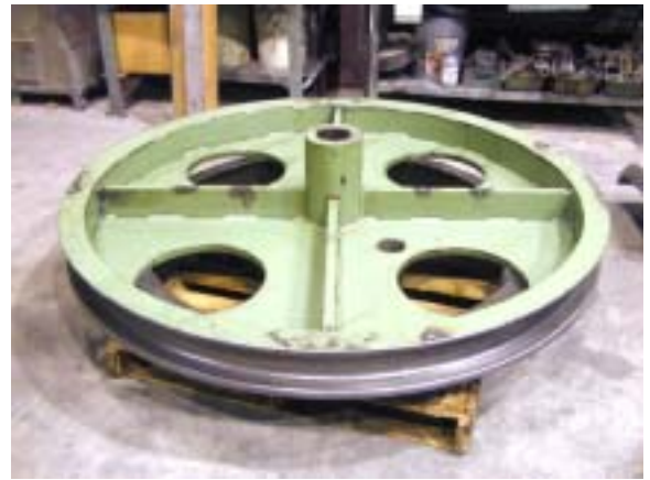
2-step 48-60" diameter coiler wheel, built up with 420 stainless and finished