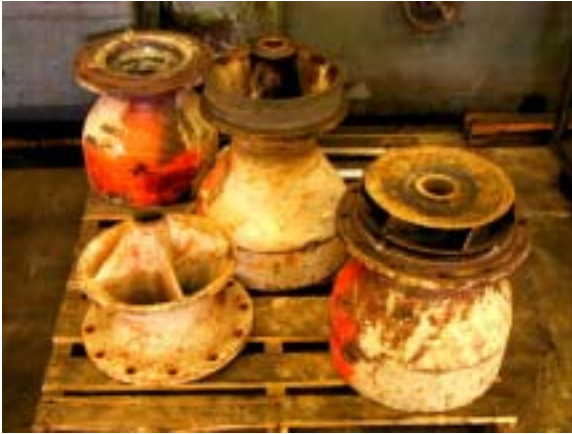
Pump parts from quarry totally rebuilt