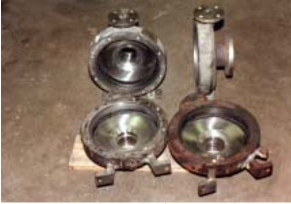
Pump housings rebuilt by welding and thermal sprayed coating