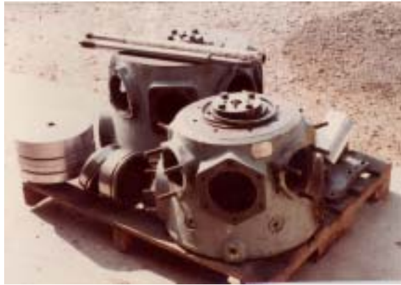
Air compressor rods, cylinder, and pistons totally rebuilt