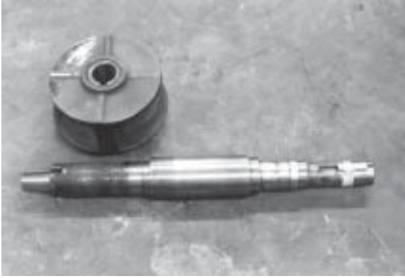
Impeller and shaft rebuilt