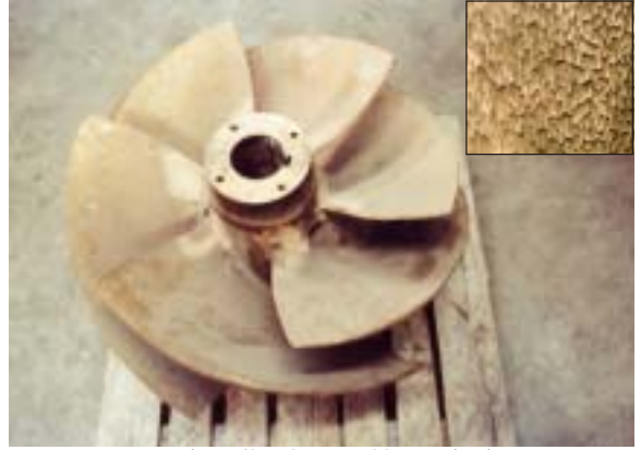
Pump impeller damaged by cavitation (see inset)