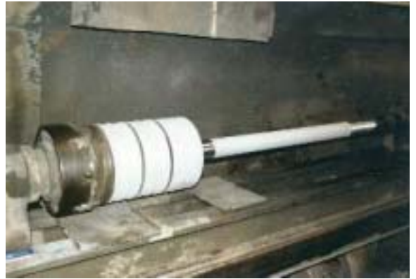
Process compressor piston and rod rebuilt (coatings: pistons-babbitt, rod-carbide)