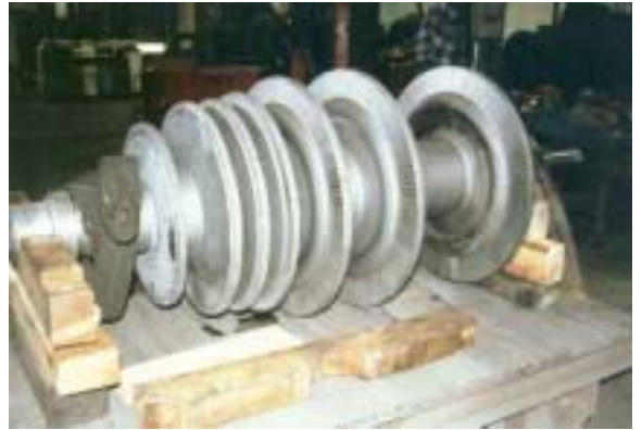
Steam turbine bearing and seal areas coated and finished