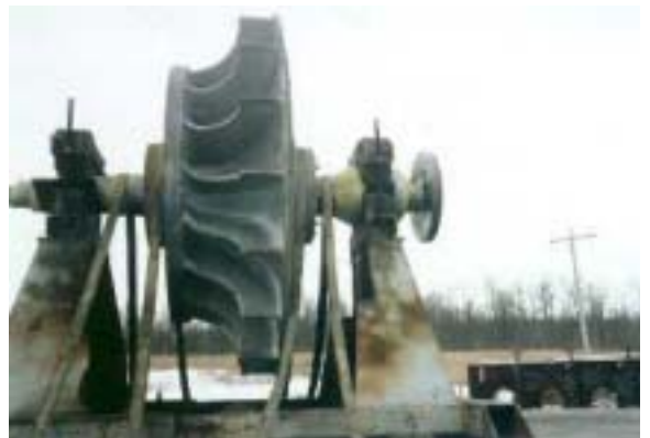
Large expander turbine reworked seal areas