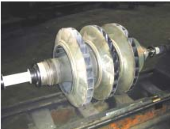
Multi-stage blower carbide coated bearing and seal areas