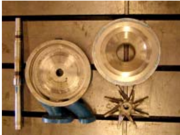
Pump parts rebuilt shaft, housing, and impeller backing plate