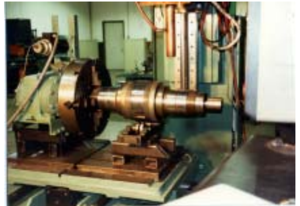
Shaft laser hardened tapered bearing area to 58-60Rc