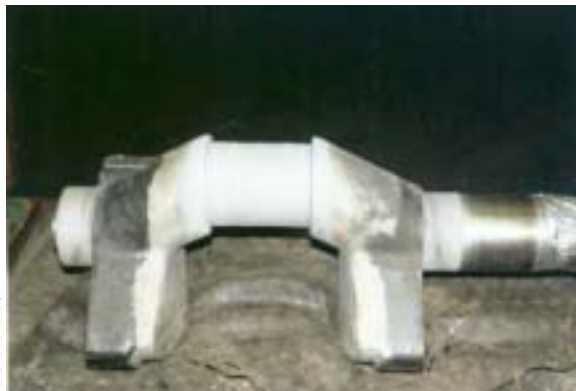
Compressor crank built up on mains and throw bearings, finish ground