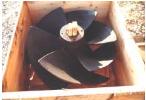
Rebuilt Impeller (see above photo) rebuilt and finished to specifications with ceramic coating