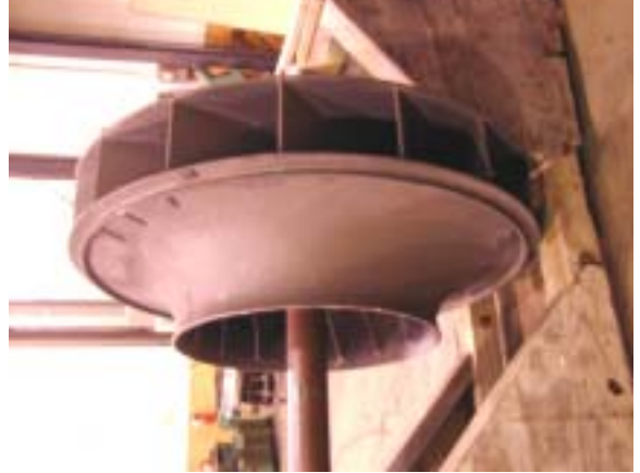
Large fan reworked bearing areas and finished 420SS coating